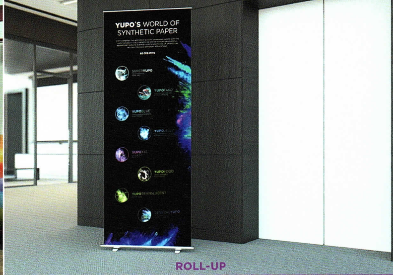
ROLL-UP YUPOXXL FPU 250