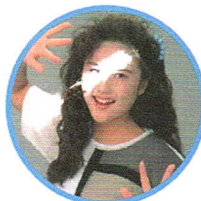
After 24 h in water rubbed 100 x with wet cloth